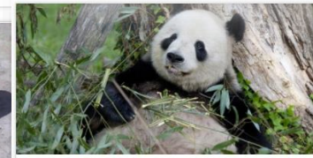
Giant Panda Cam

"I clicked on each of the pictures and watched how the animals behave. My favorite one to watch was the lion. The lion was roaming around his space. I wonder if he was looking for food. I didn't see any other animals in the space with the lion. I wonder if he is lonely."