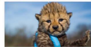
Cheetah Cub Cam

Click here to visit Smithsonian's National Zoo's website and check out the animal webcams. Explore the animals' habitats. What does the animal see? What are they doing? What might the animal think or feel? What might the animal care about? Discuss your observations with a family member or friend.